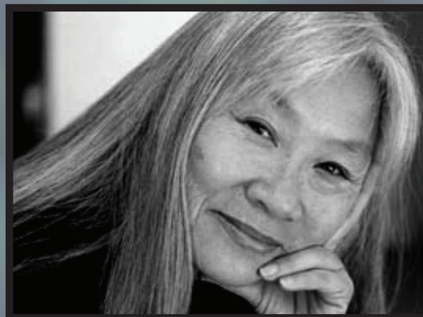
February 18 Maxine Hong Kingston