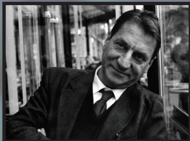
October 15 Claudio Magris