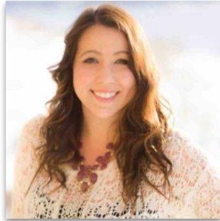
Customer Success Manager