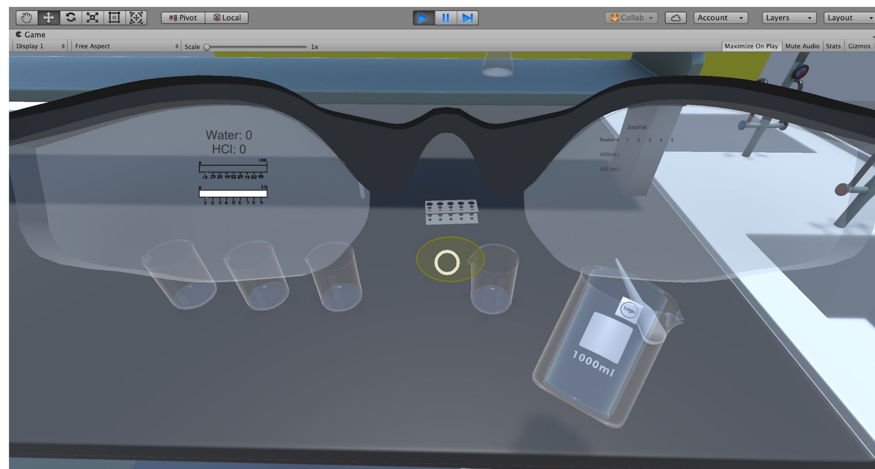
Figure 2. Unity VR Interaction: The following figure shows the user's perspective when conducting the lab. The user can virtually pick up objects (e.g. beaker) and fill them in the sink to the right. The interactive sliders shows the user how much volume is in the beaker, while following along with a list of instructions.

Figure 1. Unity Editor: The following shows our Unity editor, which is our typical work environment for building our simulation. This is essentially where all non-backend work was done, such as scene development, model implementation and other UI elements. This project is divided into four scenes, the main menu, the lab environment, the quiz scene, and the end screen. Most development was done in the lab environment scene.